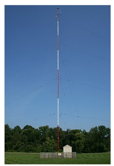
Typical <u>mast radiator</u> of a commercial medium wave <u>AM</u> <u>broadcasting</u> station, Chapel Hill, North Carolina, U.S.

MW was the main radio band for broadcasting from the beginnings in the 1920s into the 1950s until FM with a better sound quality took over. In Europe, <u>digital radio</u> is gaining popularity and offers AM stations the chance to switch over if no frequency in the FM band is available, (however digital radio still has coverage issues in many parts of Europe). Many countries in Europe have switched off or limited their MW transmitters since the 2010s.